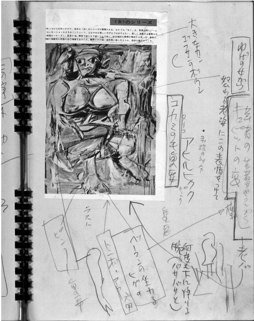
Hijikata Tatsumi, «Nadare Ame Scrapbook», p. 19